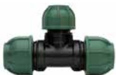
224 enlarged 90° tee