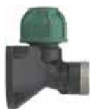
223 wall plate elbow